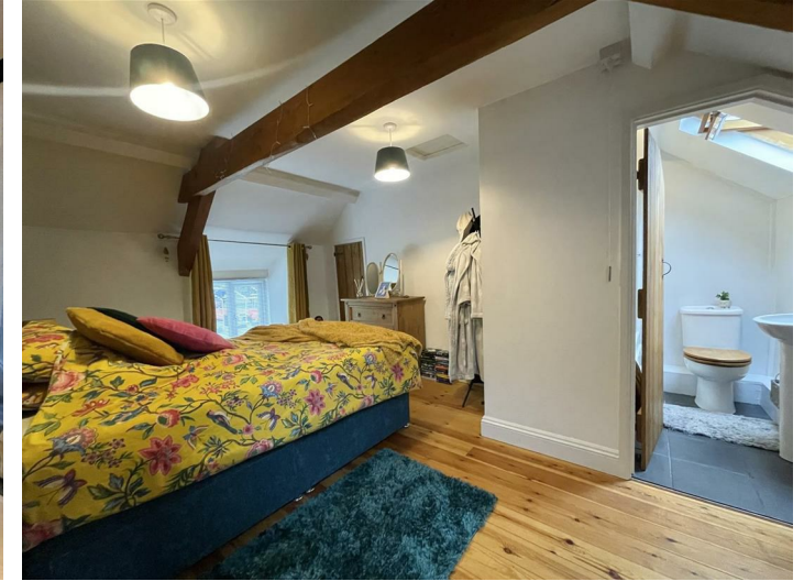
A charming primary bedroom with window to fore, storage cupboard, exposed beams and floorboards. Door to En Suite