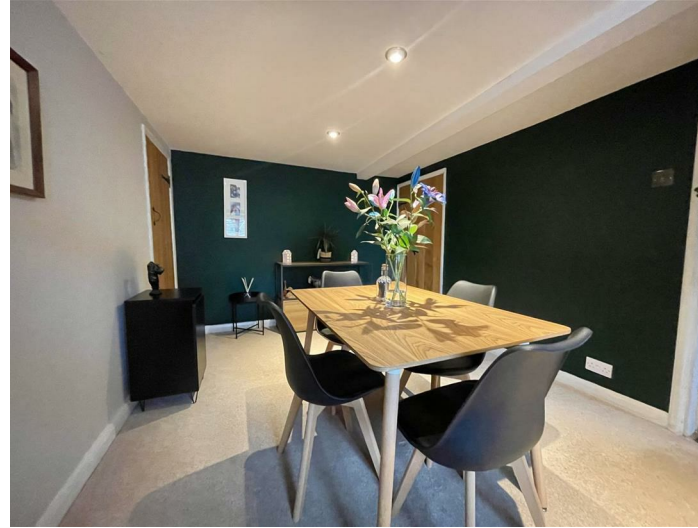
A spacious dining area or home office with window to fore and storage cupboards.