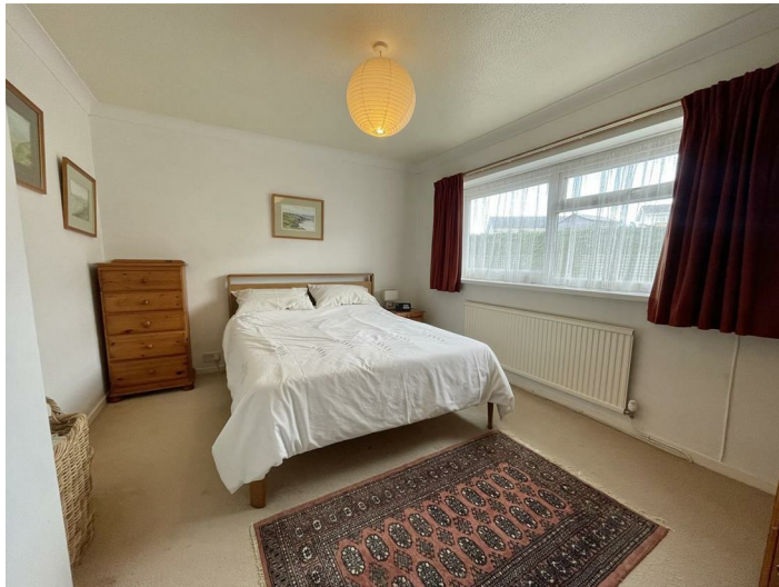
Radiator and window to rear.