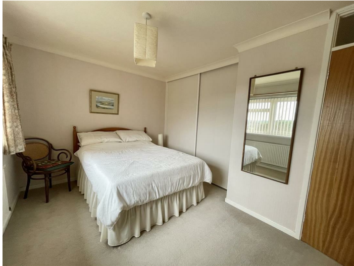
Fitted wardrobes, radiator and window to fore.