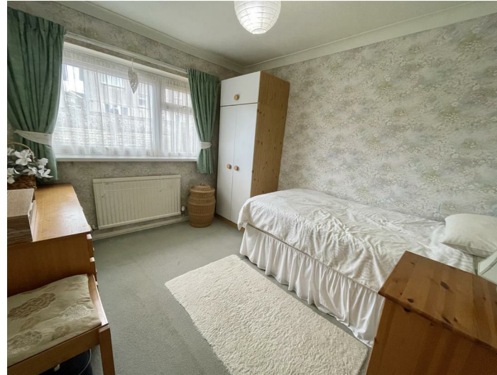
Radiator and window to rear.