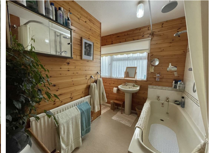
WC, Pedestal Washbasin, bath with raindrop shower over and screen, radiator, part tiled. Pine panelling wall feature, obscured window to fore.