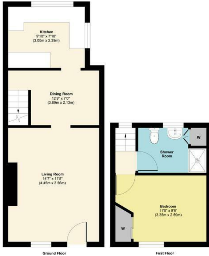
Illustration for identification purposes only, measurements are approximate, not to scale. Produced by Elandaris Property