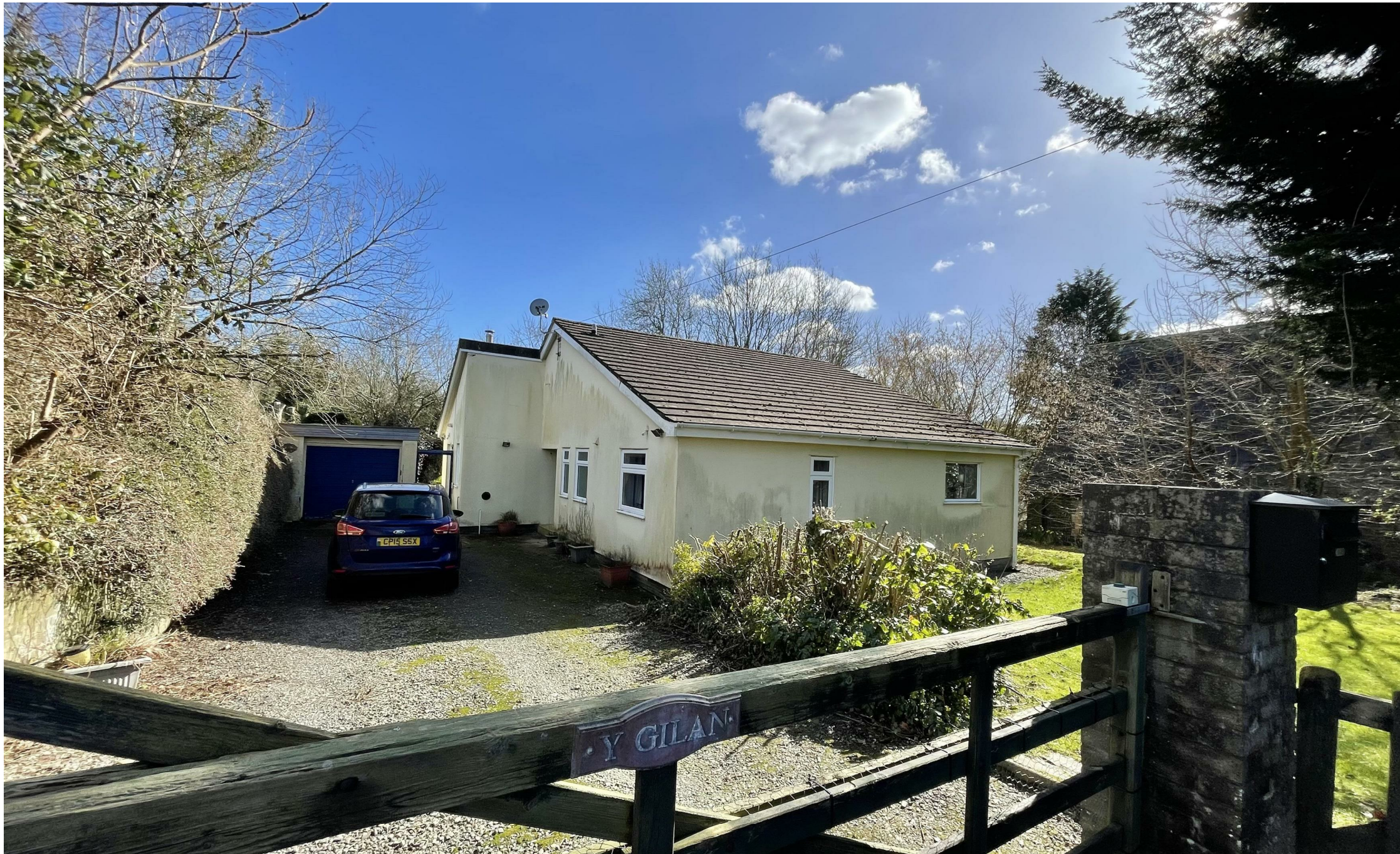
Y Gilan Dol-Y-Bont, Borth Aberystwyth Ceredigion SY24 5LX Guide price £305,000