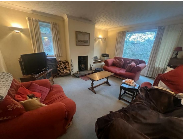
with Charnwood wood burner set on slate hearth, large picture window to side, two other side windows, wall lighting and radiators.