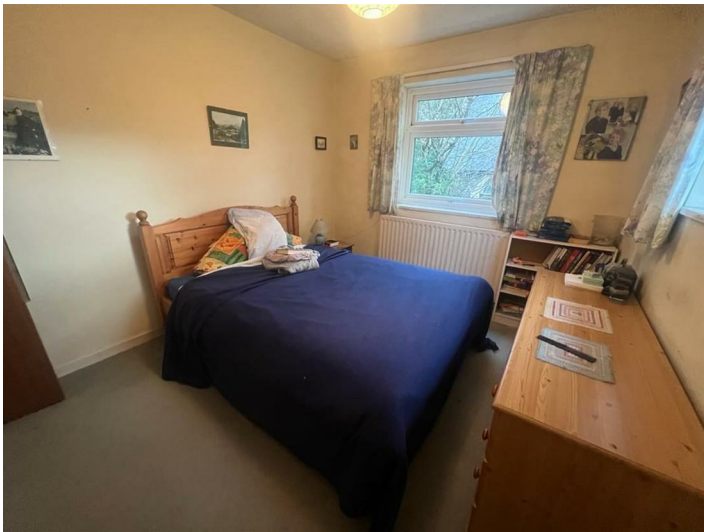
with window to side and fore. Fitted cupboard and radiator.