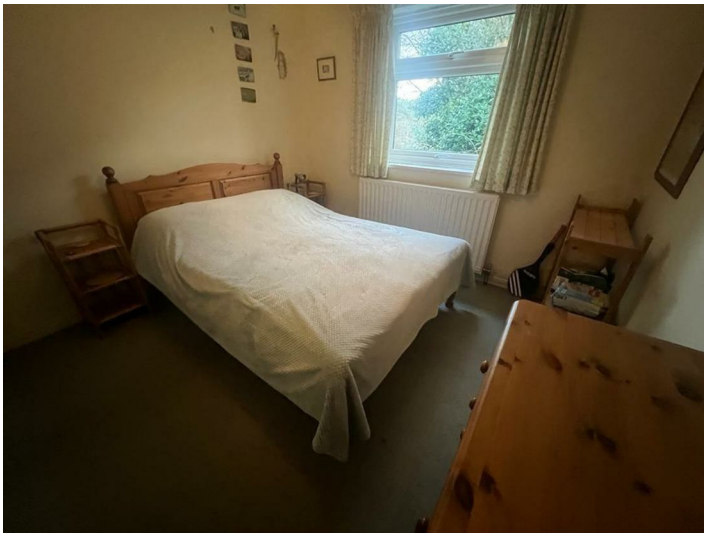
with window to side, fitted wardrobe and radiator.