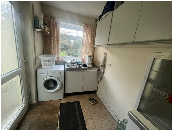
comprising single drainer stainless steel sink unit, eye level units, Bosch automatic washing machine and Hotpoint upright fridge/freezer. Free-standing Worcester oil fire central heating boiler, windows and door to side. Part tiled floor.