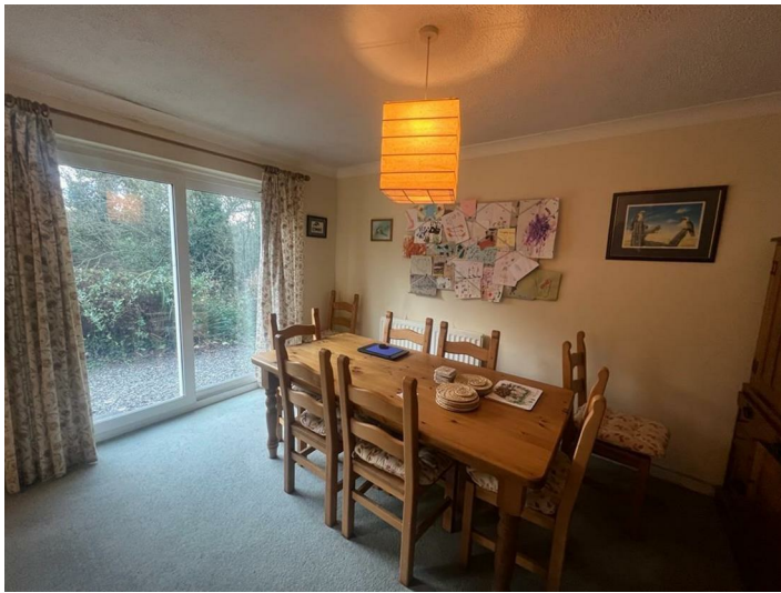
Dining area –with patio doors to garden and radiator.