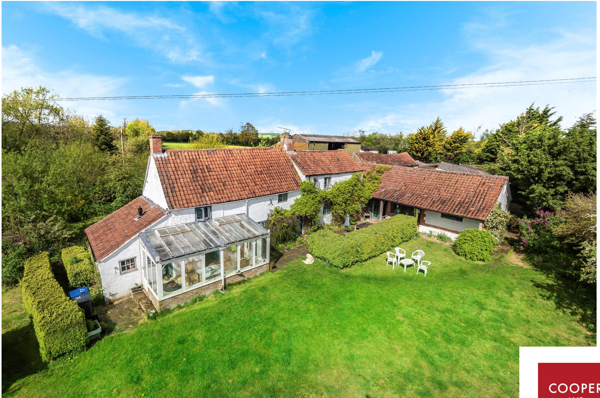
Little Fairwood Farm, Fairwood, Dilton Marsh Wiltshire