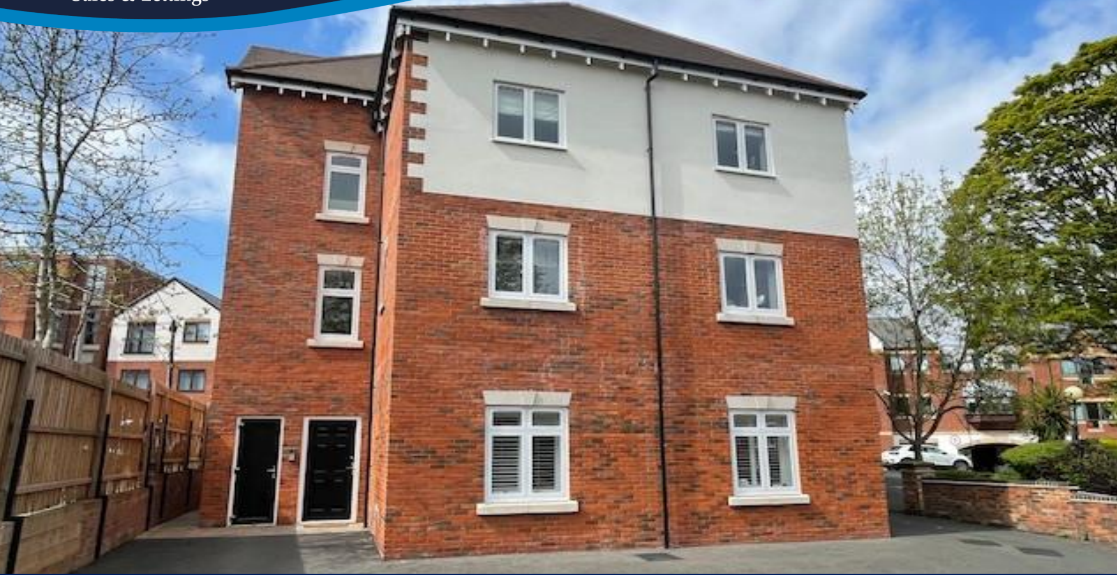
Mill House, Midland Drive, Sutton Coldfield, B72 1TU