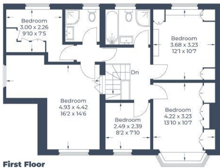
Illustration for identification purposes only, measurements are approximate, not to scale. Produced for Robsons