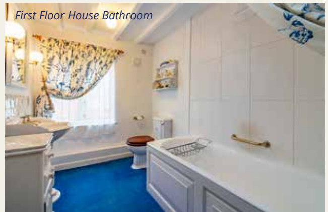
First Floor House Bathroom