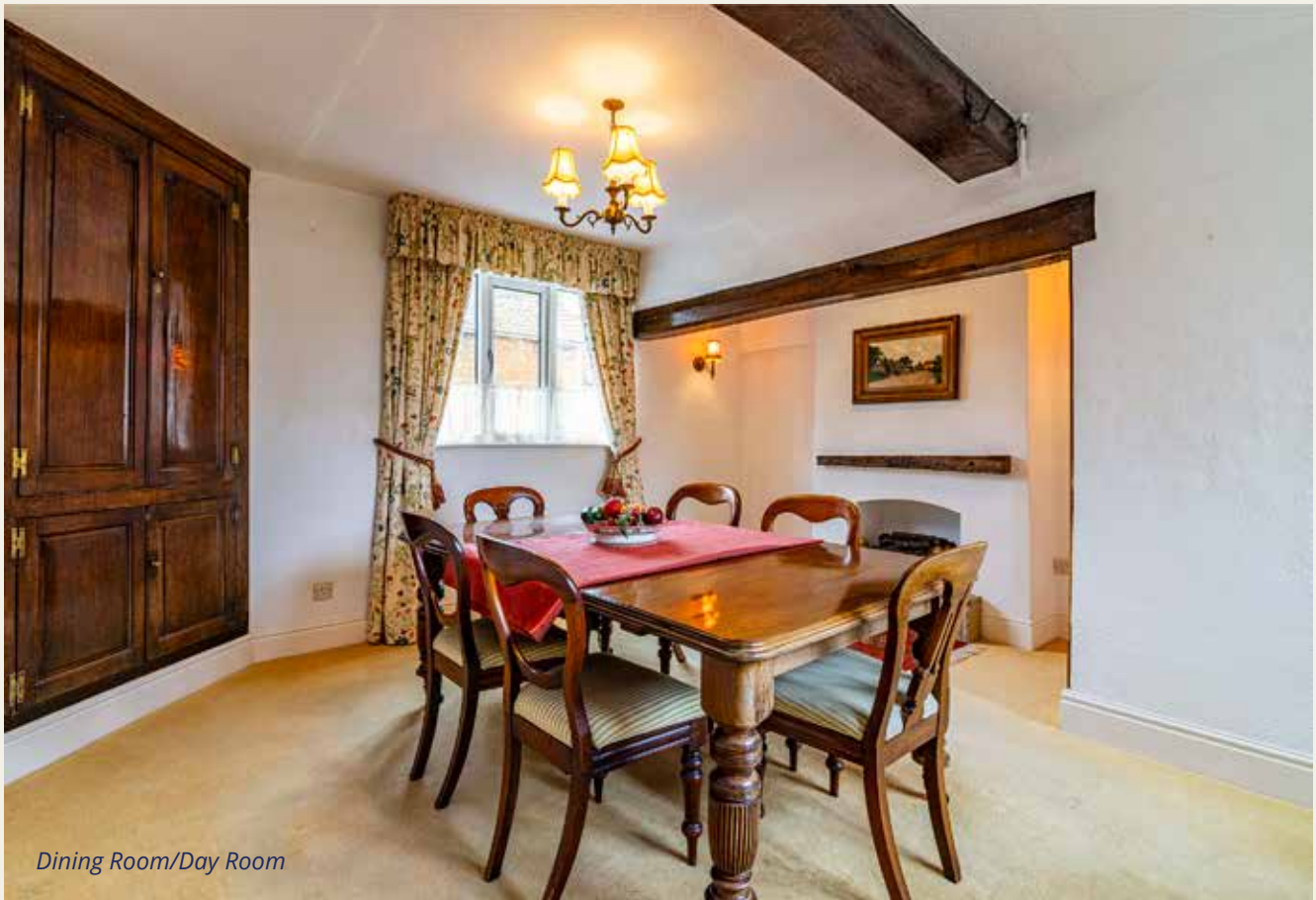
Dining Room/Day Room