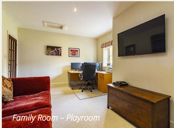
Family Room – Playroom