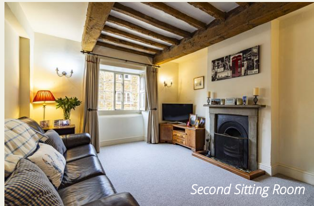
Second Sitting Room