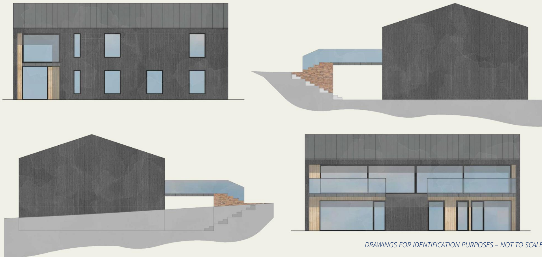
DRAWINGS FOR IDENTIFICATION PURPOSES – NOT TO SCALE

SMITH & PARTNERS • LAND & ESTATE AGENTS 16 MARKET PLACE SOUTHWELL NOTTINGHAMSHIRE NG25 0HE 01636 815544 sales@smithandpartners.co.uk