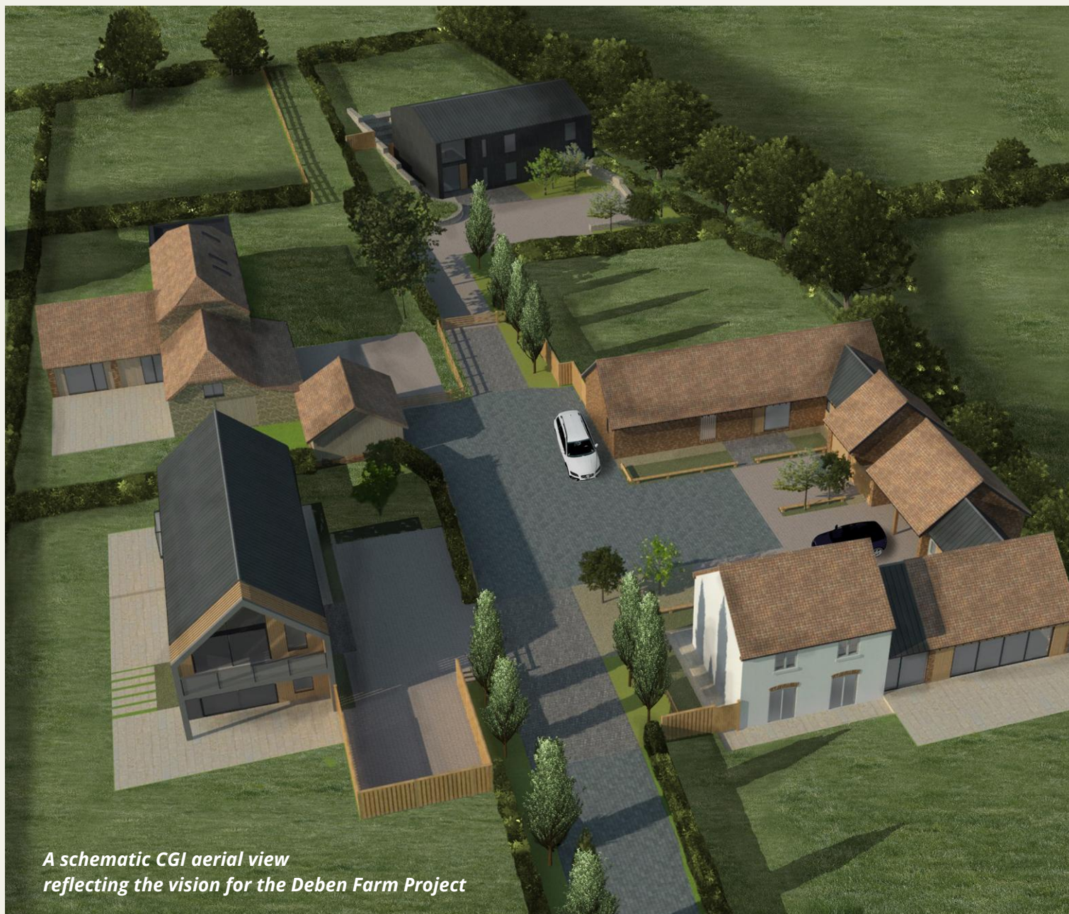
A schematic CGI aerial view reflecting the vision for the Deben Farm Project