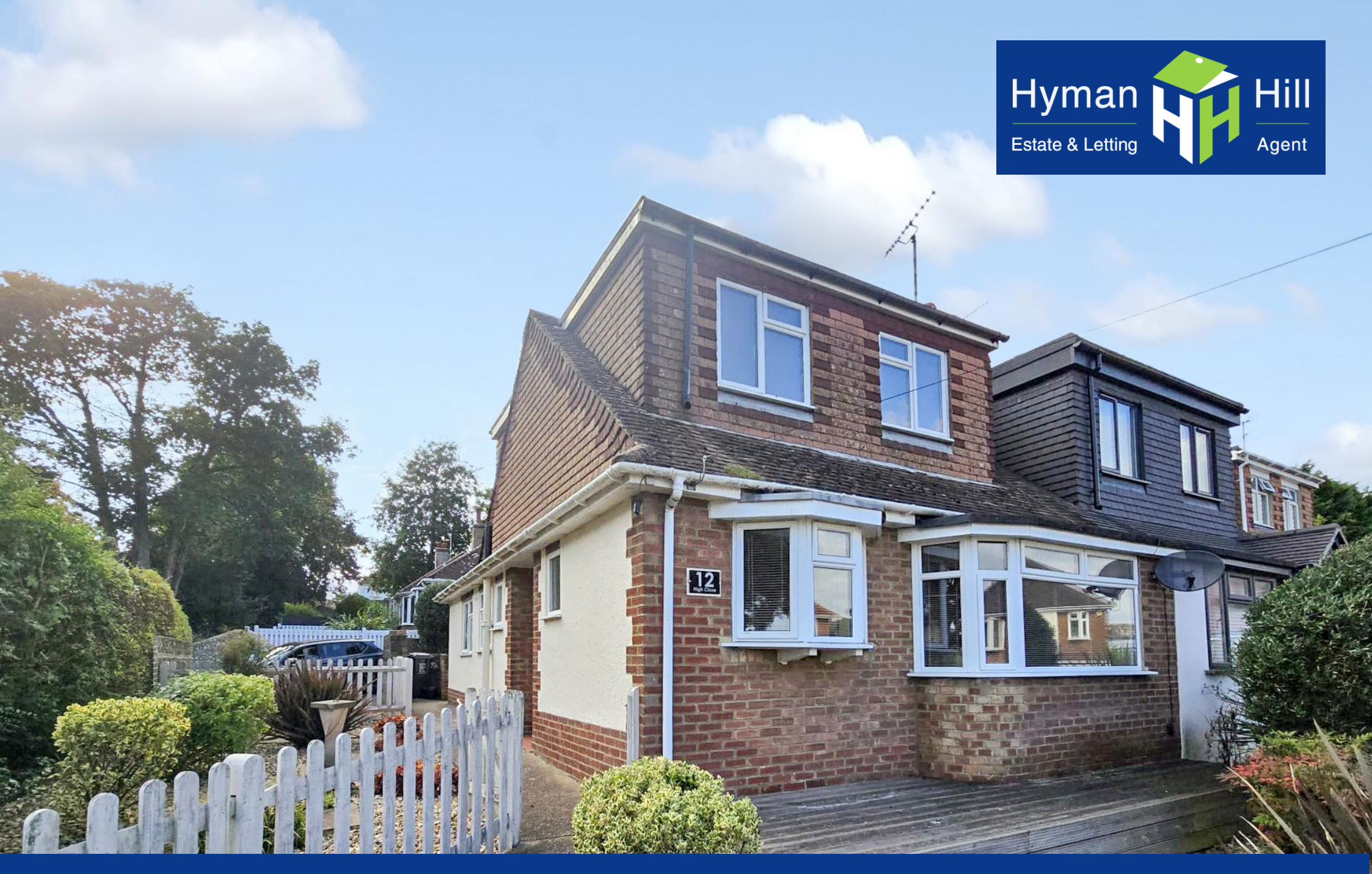
12 High Close, Portslade, East Sussex, BN41 2PD