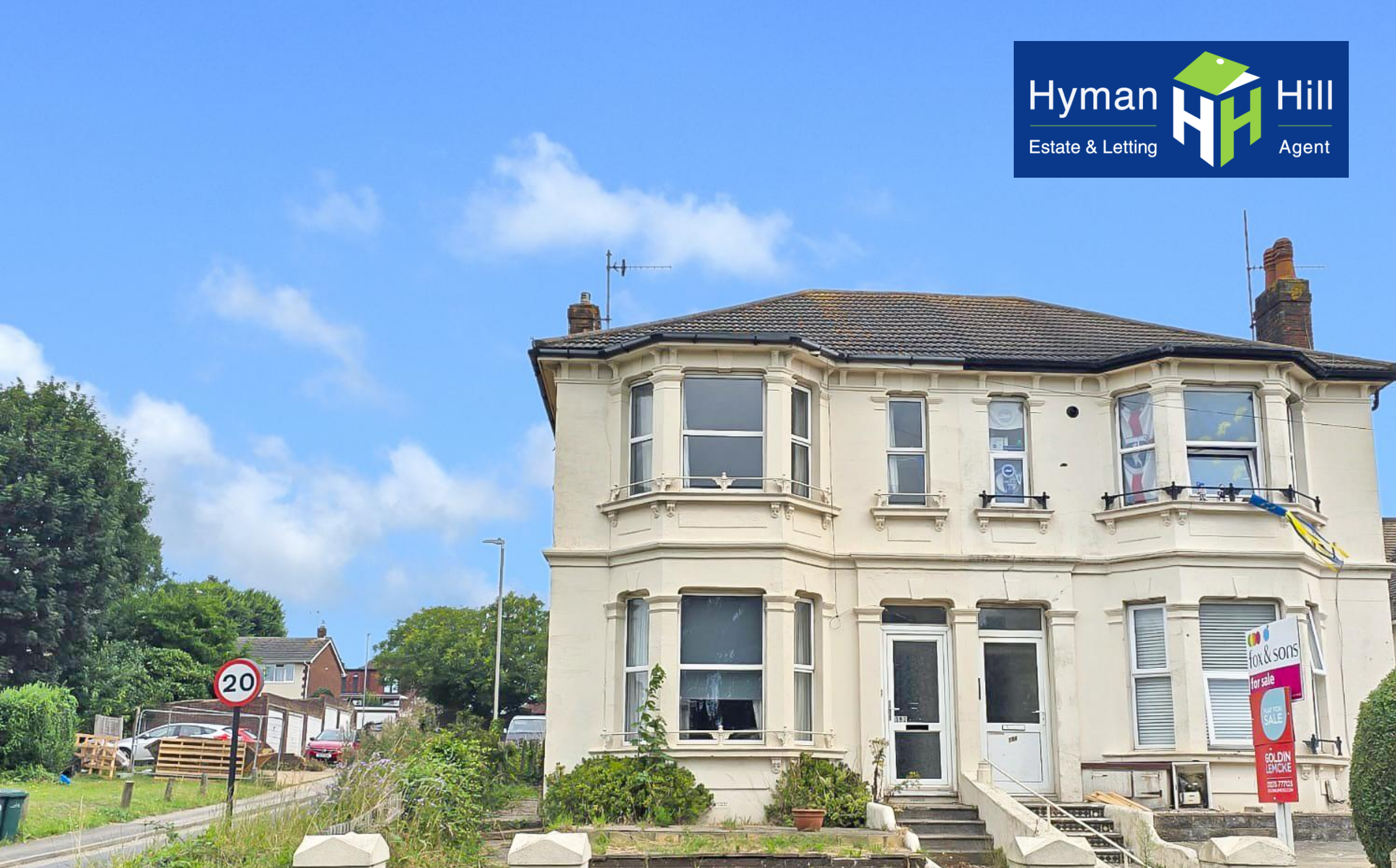
192 Old Shoreham Road, Portslade, East Sussex, BN41 1UB