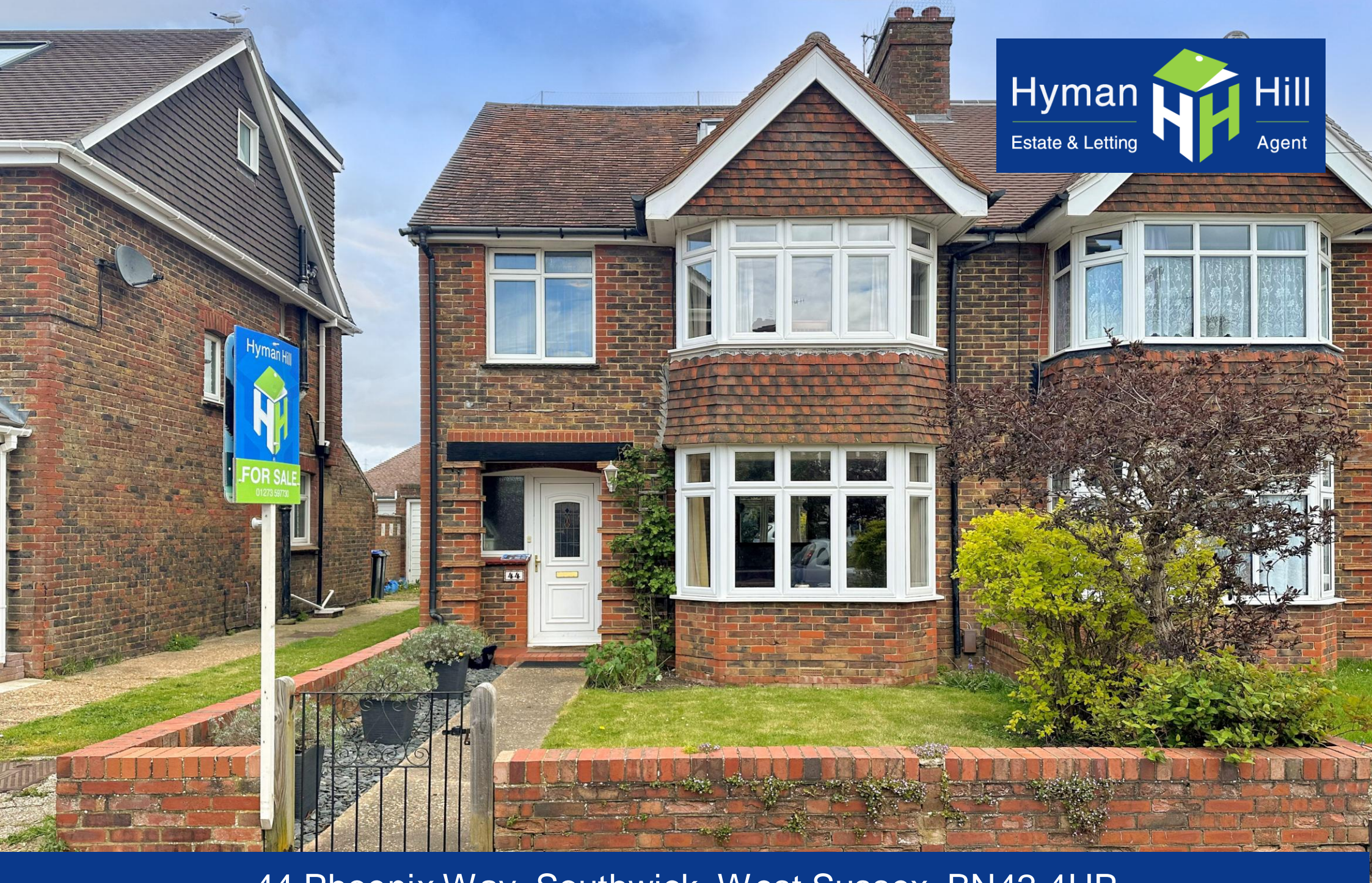
44 Phoenix Way, Southwick, West Sussex, BN42 4HP