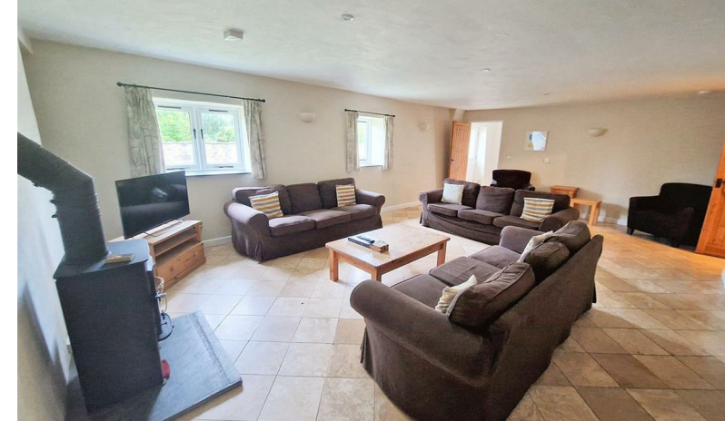
TREGAVETHAN, TRURO £2,500 PCM