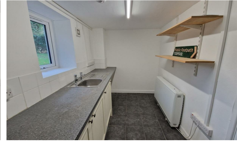
BOWNDER AN SYCAMOR, ST DAY £850 PCM