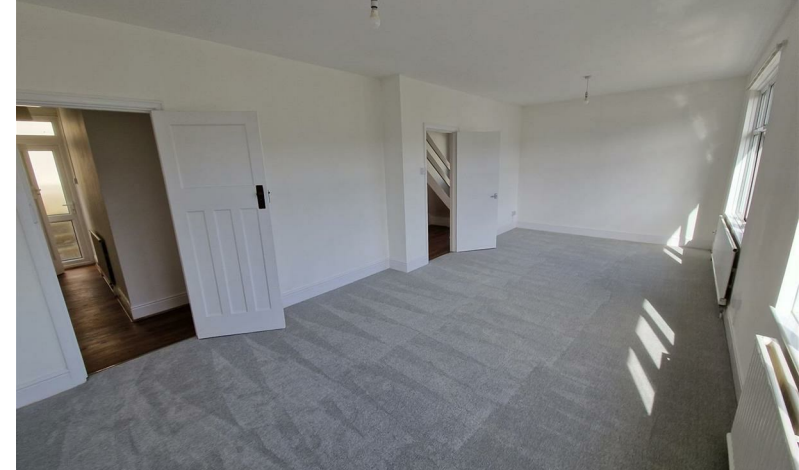
TRESILLIAN £1,450 PCM