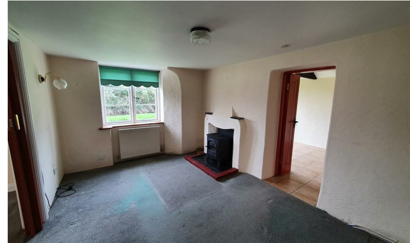
TRESILLIAN, TRURO £1,500 PCM