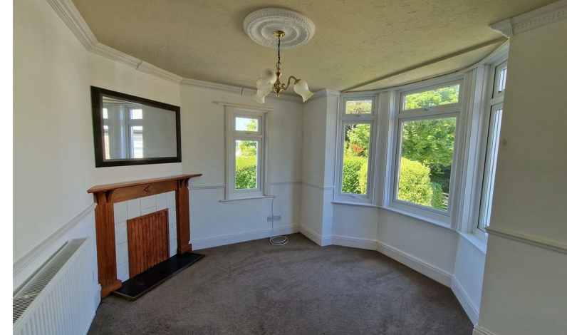
FORE STREET, GRAMPOUND, TRURO £1,200