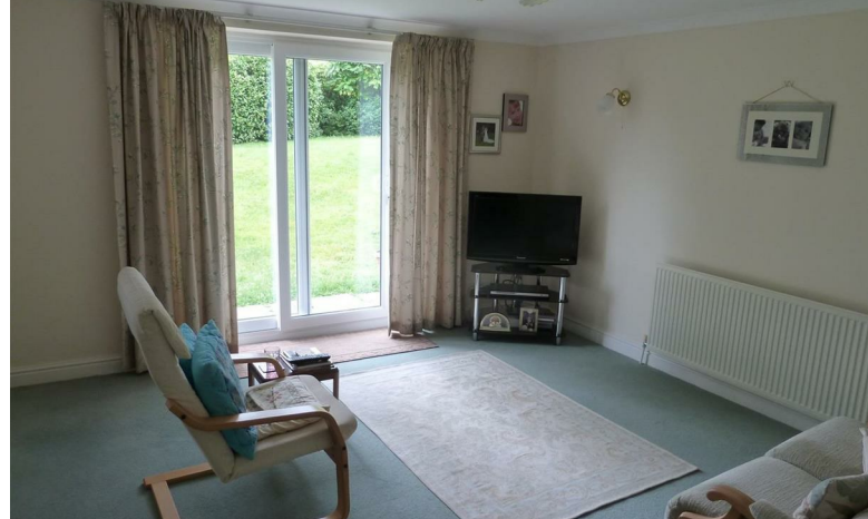
TREMORVAH COURT, TRURO £950 PCM