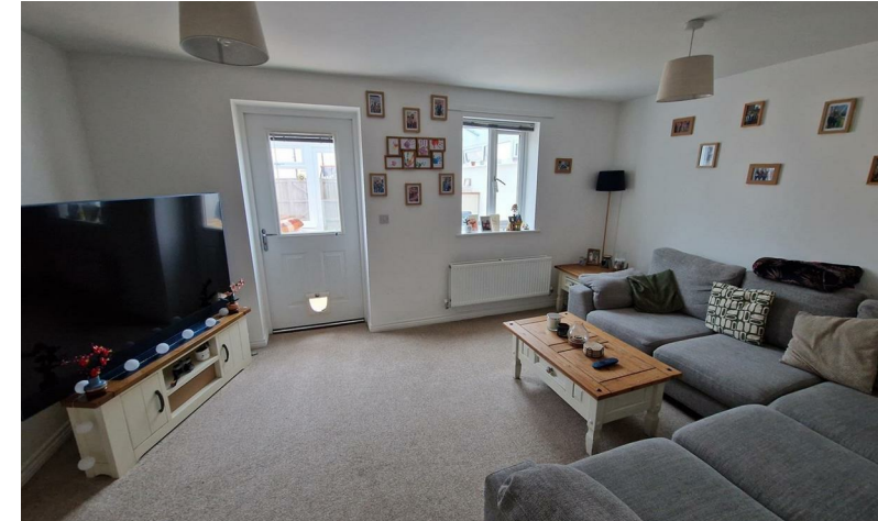
PENWETHERS CRESCENT, TRURO £1,250 PCM