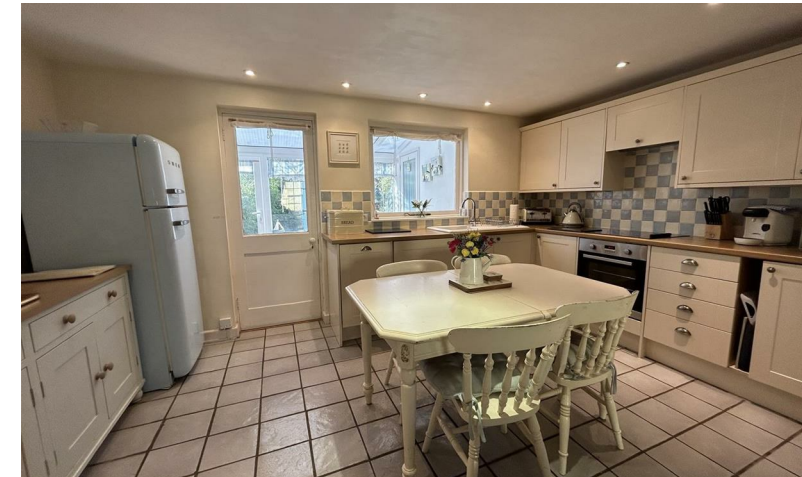
CHAPEL STREET, PROBUS £1,200 PCM