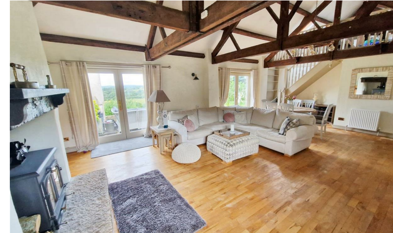
SPARNOCK, TRURO £2,500 PCM