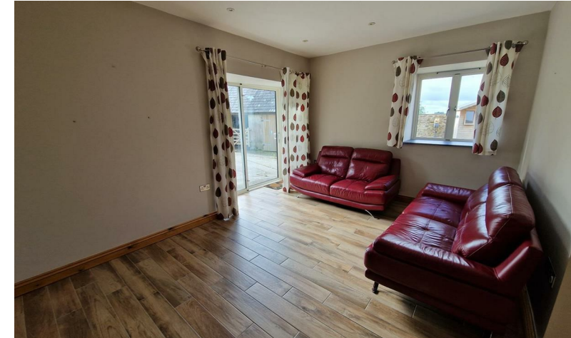
ST. EWE, ST. AUSTELL £1,100 PCM