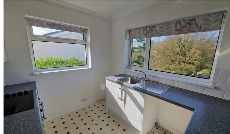
CHELLEW ROAD, TRURO £1,100 PCM