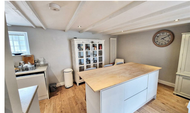
TREVEOR, GORRAN £1,450 PCM