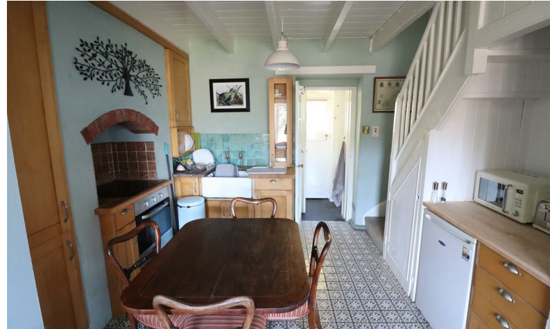
SCOBLES TERRACE, MALPAS £850 PCM