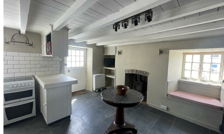
CHURCHTOWN ROAD, GERRANS £825 PCM