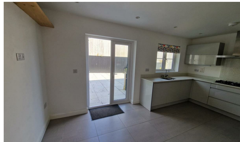
CHANDLER PARK, PENRYN £1,800 PCM