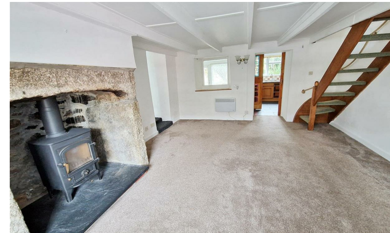
CONSTANTINE, FALMOUTH £1,200