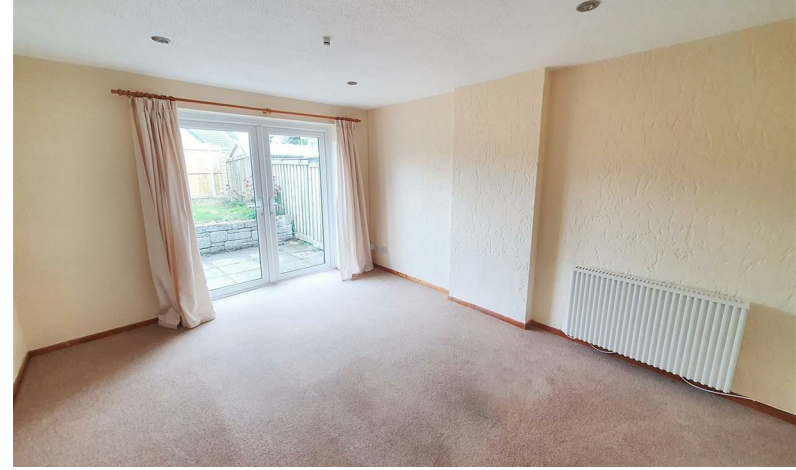
DAVEYS CLOSE, FALMOUTH £1,100 PCM