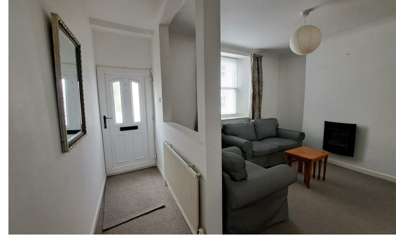
CARCLEW STREET, TRURO £1,100 PCM