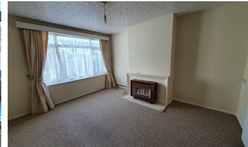
MORESK CLOSE, TRURO £1,100 PCM