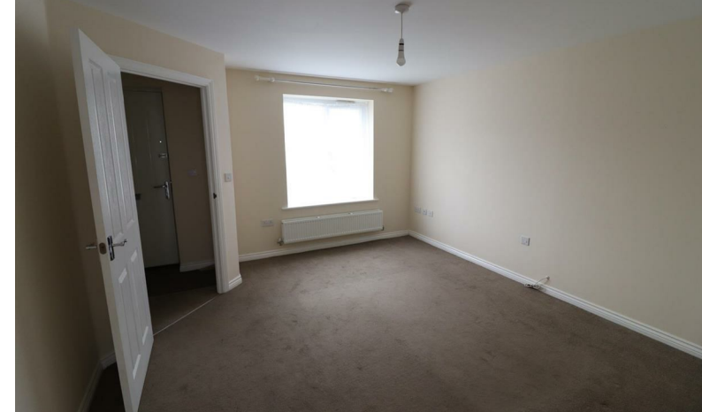
SCHOLAR ROAD, TRURO £1,350 PCM