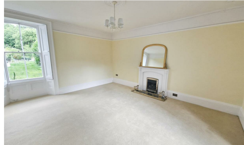
AGAR ROAD, TRURO £1,000 PCM