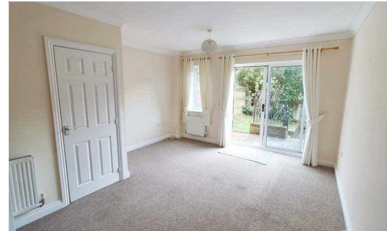
TREFFRY ROAD, TRURO £1,400 PCM