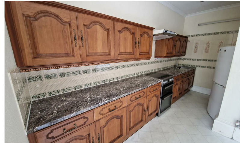
BARRACK LANE, TRURO £1,100 PCM