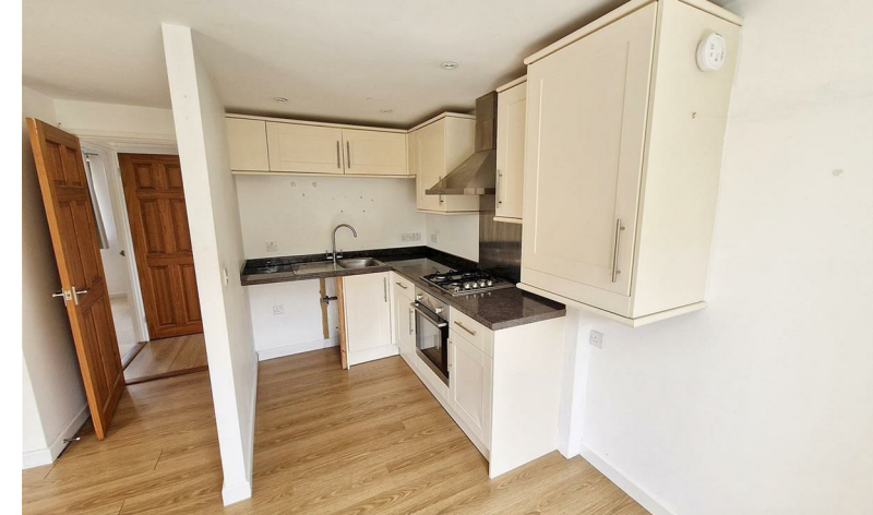
THE OLD MALTHOUSE, RUANLANIHORNE £775 PCM