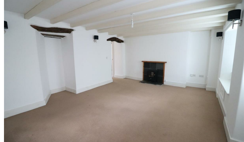
FORE STREET, GRAMPOUND £1,000 PCM