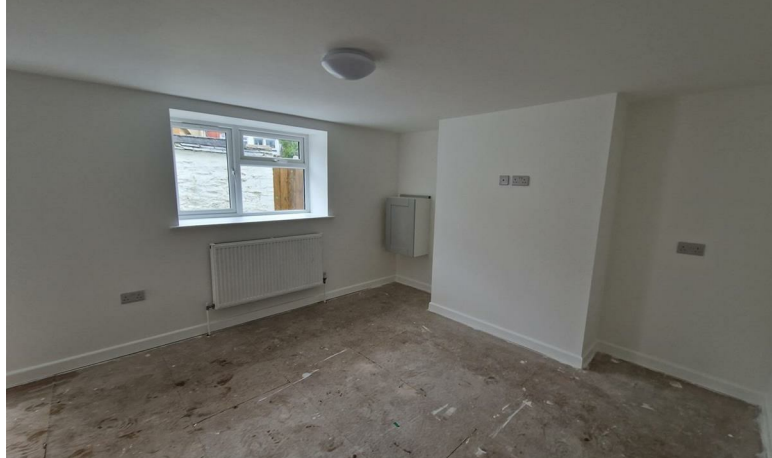
CHAPEL PLACE, TRURO £1,150 PCM