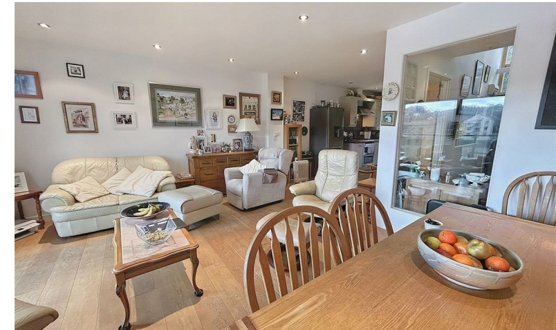
Malpas Road, Truro £1,595 pcm