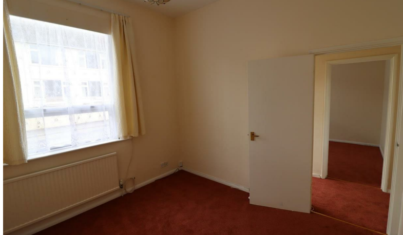
JAMES PLACE, TRURO £895 PCM