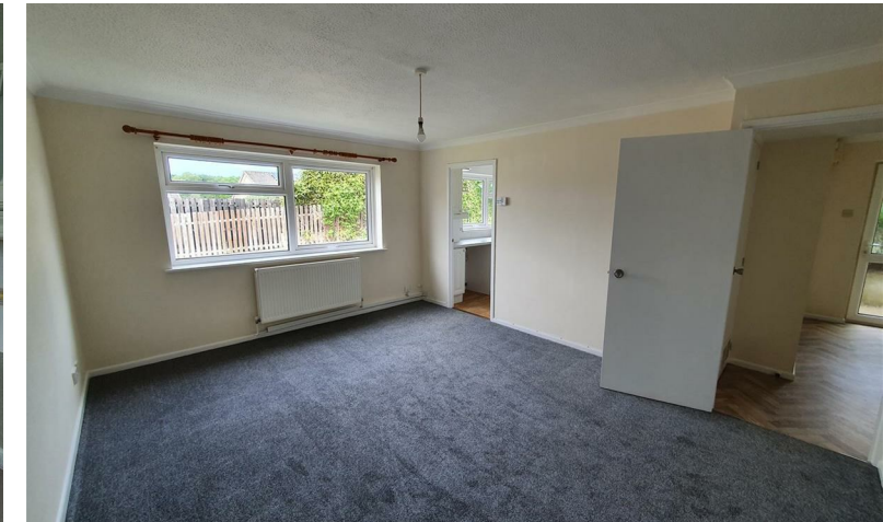
TREWIDDEN COURT, TRURO £950 PCM