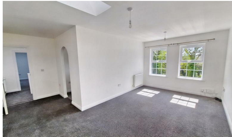
SPARNOCK GROVE, TRURO £1,100 PCM