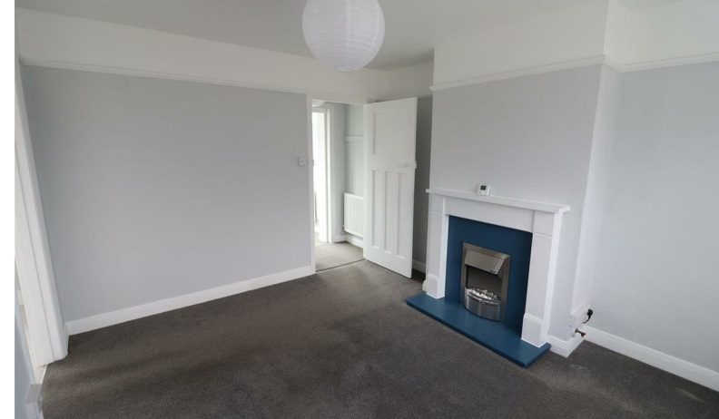
Trelander East, Truro £995 pcm