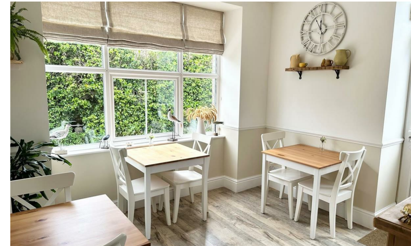
Pendower Road, Veryan £1,850