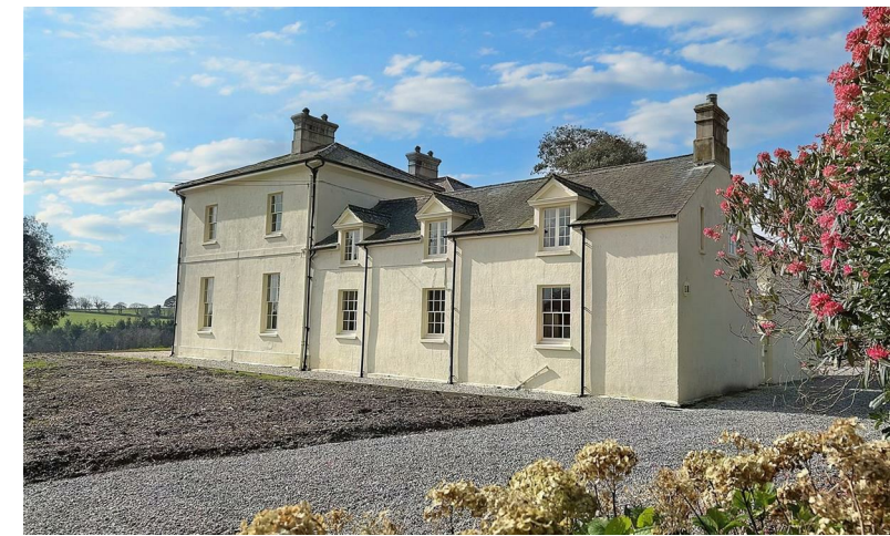
PROBUS, TRURO £2,950 PCM