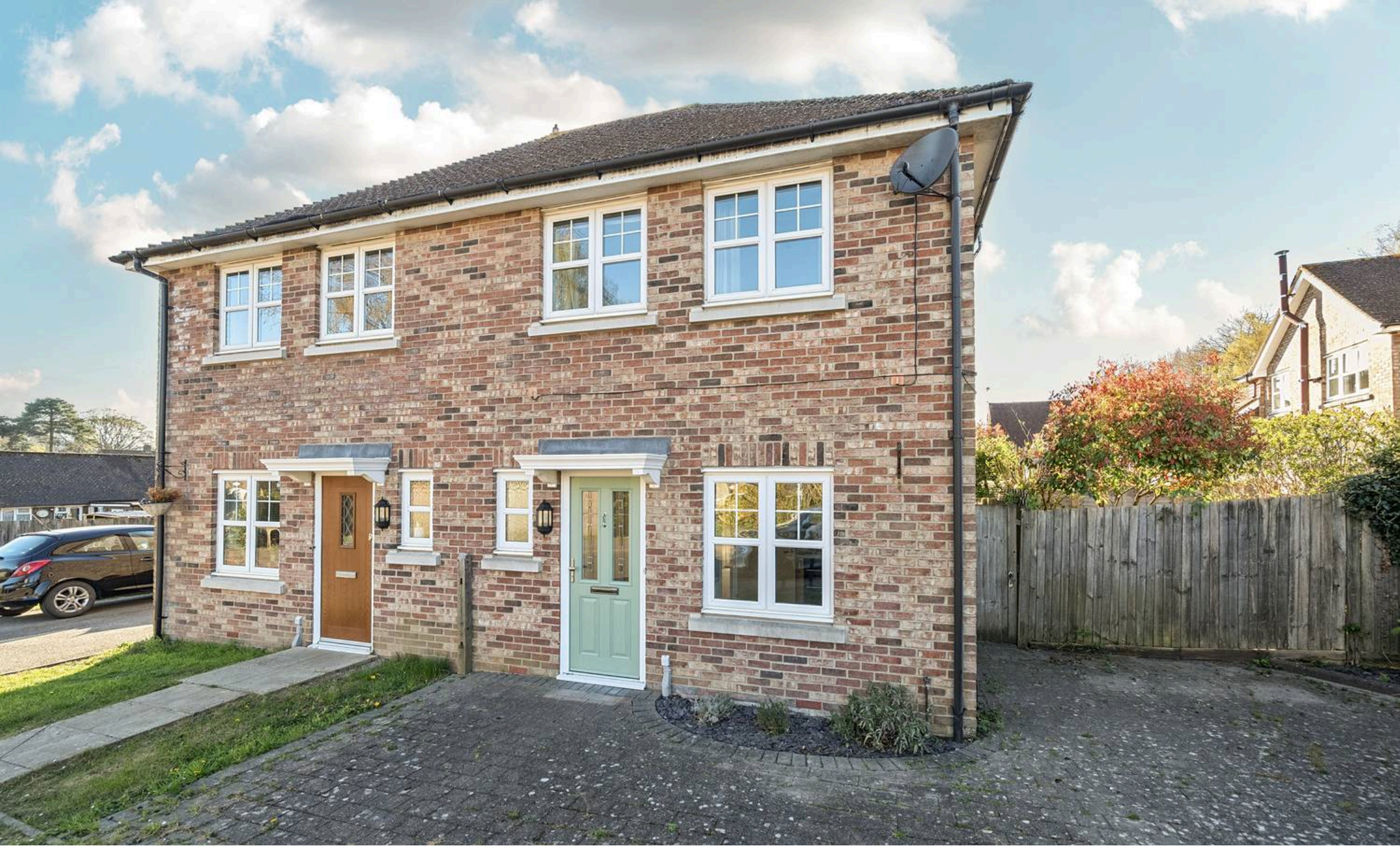
2 The Glade, Storrington - RH20 4GL £300,000