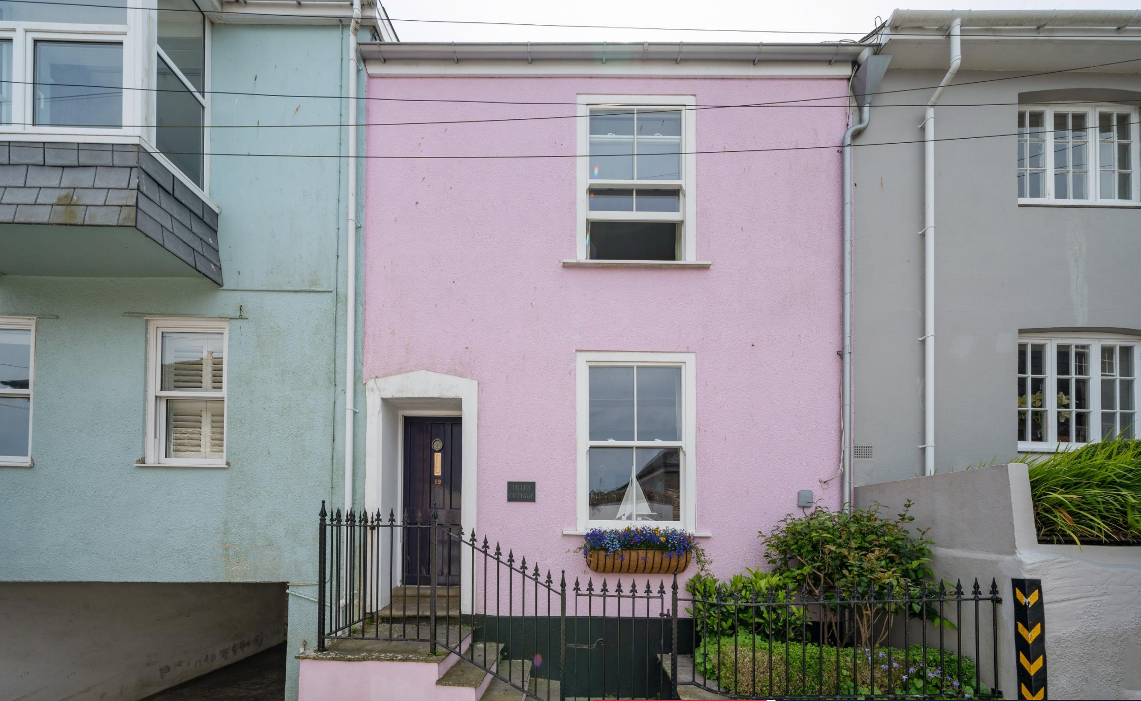
Tiller Cottage, 19 Crowthers Hill, Dartmouth, TQ6 9QX