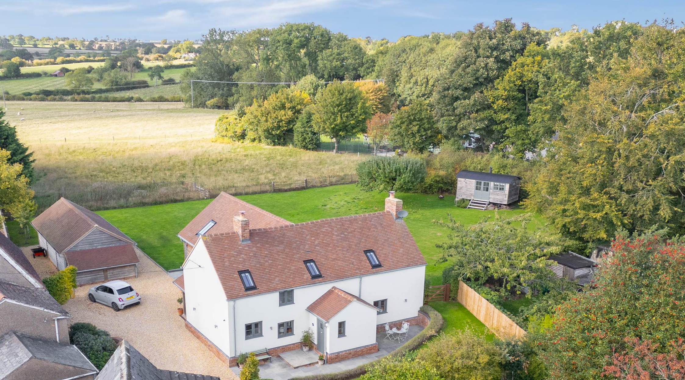
Meadow Cottage, 12 Staffords Lane, West Haddon, Northamptonshire, NN6 7AT