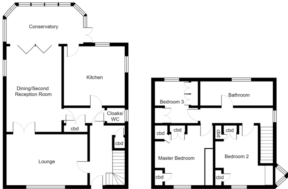
DRAFT FLOOR PLAN ONLY - AWAITING VENDORS APPROVAL

All measurements are approximate and for display purposes only